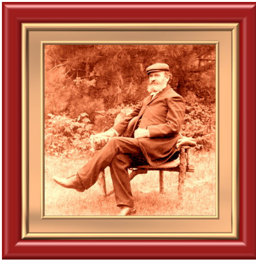
Albert Benjamin Simpson